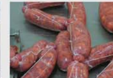
The high versatility of tying patterns allows tying such as the Galician ball.