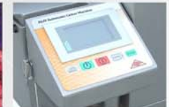
The touch screen gives results from the first day with minimal learning.