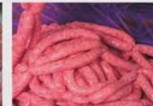
The great accuracy in setting the tying enables to tie bundles of great difficulty such as the triple sausage.