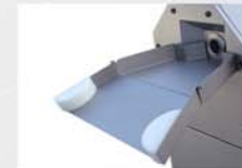
Jointed tray for adjustment to different heights of table series.

POWER: 4.5CV CONSUME: 2.8KW MAXIMUM TYING SPEED: 180 PORTIONS / MIN. PRODUCTION: DEPENDING ON SIZE TYING LENGTH: 15MM. TO 999MM. MAXIMUM PRODUCT DIAMETER: \varnothing 45 TRANSMISSION: TOOTHED BELT WHEELS: REAR FIXED / FRONT SWIVEL