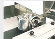
Jointed tray for adjustment to different heights of table series.

CONSUME: 600LTS / MIN MAXIMUM TYING SPEED: 160 PORTIONS / MIN. PRODUCTION: DEPENDING ON SIZE TYING LENGTH: 15MM. TO 150MM. MAXIMUM PRODUCT DIAMETER: Ø45 PRESSURE: 6 BAR PNEUMATIC PRESSURE INDICATOR: GLYCERINE MANOMETER IN CENTRAL PANEL SAFETY: AUTOMATIC STOP WHEN OPENING LID CONTROLS: PNEUMATIC ON/OFF BUTTONS BASE: THERMOPLASTIC WITH RUBBER SOLES