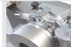
Thread tension adjustment programmable.