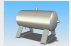
The Pneumatic system has an expansion boiler to maintain a constant pressure, minimizing fluctuations in the network.