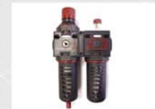
Autolubricated filter with automatic purge included.