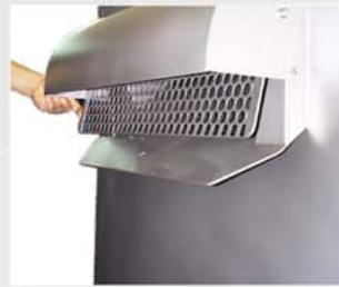
The till exit door avoids accidents and allows a more controlled product exit.