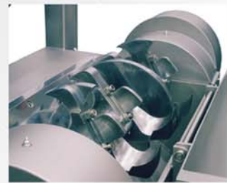
Its blades are set to make a homogenous cut; with no need to sharpen the blades.