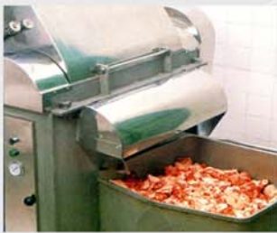
Suitable for cutting and mincing without tempering.