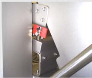
Its high security systems ensure its use with the strictest standards.