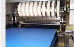
D3000 uses a floating blade holder system that allows a perfect fitting to any piece.