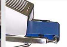
The outlet conveyor belt is adjustable in height to fit any table.