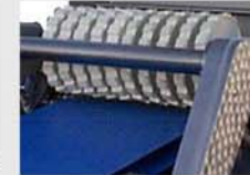
the conic attacking gums tense the piece for an optimum peeling.