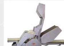
The protection of double opening allows easy and safe access.

SAFETY: SAFETY CONTACT LID OPENING ACCORDING TO THE CE STANDARDS CHAIN TRANSMISSION: ANGLE OF OUTPUT BELTS: ADJUSTABLE HEIGHT PROTECTION OF DOUBLE OPENING: INLET AND OUTLET