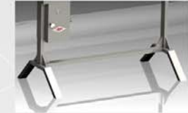
Base adapted for an ergonomic working height.