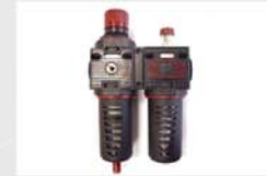
Autolubricated filter with automatic purge included.

Maximum stuffing length: 600mm Diameter: adaptable from Ø75 to Ø85 Production: up to 120 portions/min. Working pressure: 6 BAR Closure chamber: Manual. Rack system - crab Stuffing: Semi-automatic with pneumatic operation Operation: Knee push button