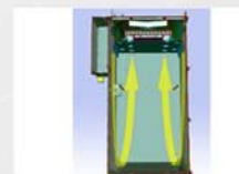
The heat distribution circuit of own design ensures a homogeneous cooking across the chamber.