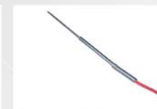
The temperature catheter to use it like a parameter for cooking adjustment.