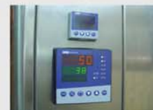
The operator control panel allows to create precise cooking programs and then memorize them.