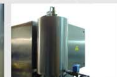
The independent boiler allows a complete humidity control up to 100%.