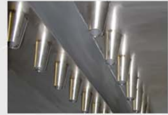
Air / Smoke inlet tubes.