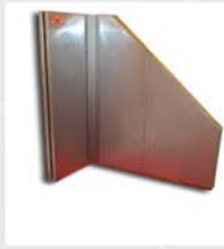
Elaborated with stainless steel panels and rockwood.