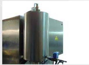
The independent boiler allows a complete humidity % control. Optional for electrical warm-up.