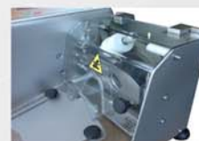
The transparent lid makes work easier with maximum security.

POWER: 0,5 CV (0,35KW) TYING LENGTH: 15MM TO 250MM CONSUME: MAXIMUM PRODUCT DIAMETER: 45 TYING SPEED: ADJUSTABLE FROM 15 TO 90 PORTIONS/MIN THREAD CUTTER: INTEGRATED PRODUCTION: DEPENDING ON SIZE THREADING MACHINE: INCLUDED WITH INTEGRATED SUPPORT TREAD LAPS PER TYING: 4 LAPS (2,5 EFFECTIVE) TRANSMISSION: REDUCER ENGINE AND TOOTHED BELT THREAD TENSION ADJUSTMENT: THROUGH PRESSURE REGULATOR STANDARD NETWORK VOLTAGE: 220V MONOFASIC 50/60HZ