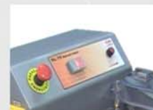
4 types of interval between tying to adapt to all types of products. A lighted led indicates the active mode.