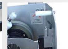
Includes threading machine with integrated support near the key for dismantling blades.