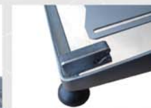
Its design without base prevents accumulation of dirt and makes its cleaning easier.