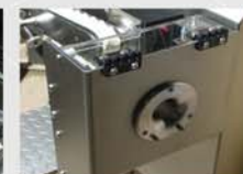
Feeding mouth height for an ergonomic work system.