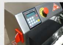
Standard electronic manager for all options.