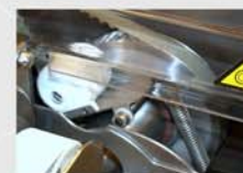
Quick-change spool of thread.