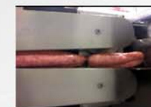
Uniformity of servings.