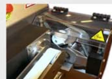
The transparent lid PETG makes work easier with maximum security.

Tying length: 15mm to 250mm. Maximum product diameter: Ø45 Thread cutter: Integrated Threading machine: Included with integrated support Tied transmission: Reducer engine and toothed belt Tightener transmission: Direct engine and gears Standard network voltage: 220V Monofasic 50/60Hz