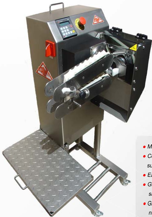
Plataform for collecting product box

ERGONOMIC work system according to the prevention system for the safety and health of the worker.