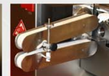
Automatic output of the products by food rubber bands.