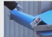
The easy disassembly of the belts without tools, facilitates maintenance and cleaning.