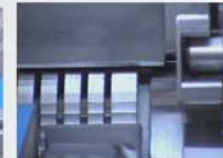
The accurate and easy blade height adjustment allows a great variety of cuts and adapt itself to different products.