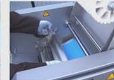
The quick and easy disassembly of the blade holders minimizes its changing times.