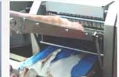
The third conveyor belt of output crust, optional, increases versatility in serial chains.